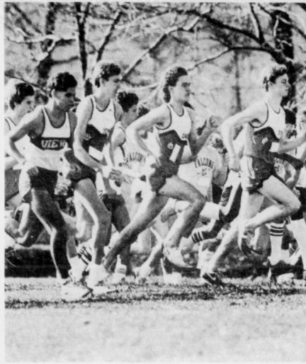
Crowd of competitors jockey for position at start of Group 2 Boys Cross-Country championship