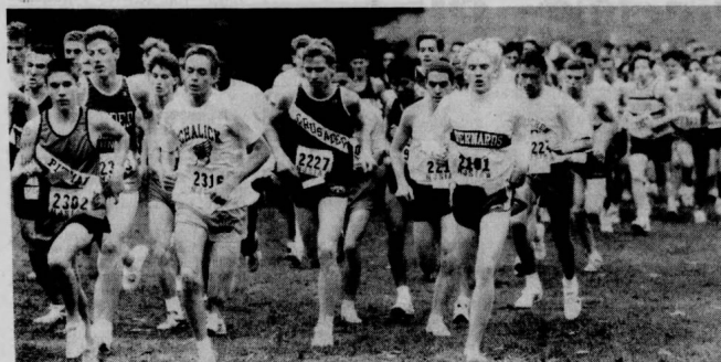
They're off and running in Group 1 boys State championship race yesterday at Holmdel Park