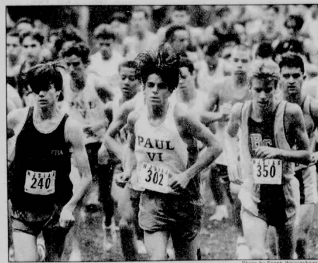
They're off and running as boys Parochial A race begins in state group championships yesterday.